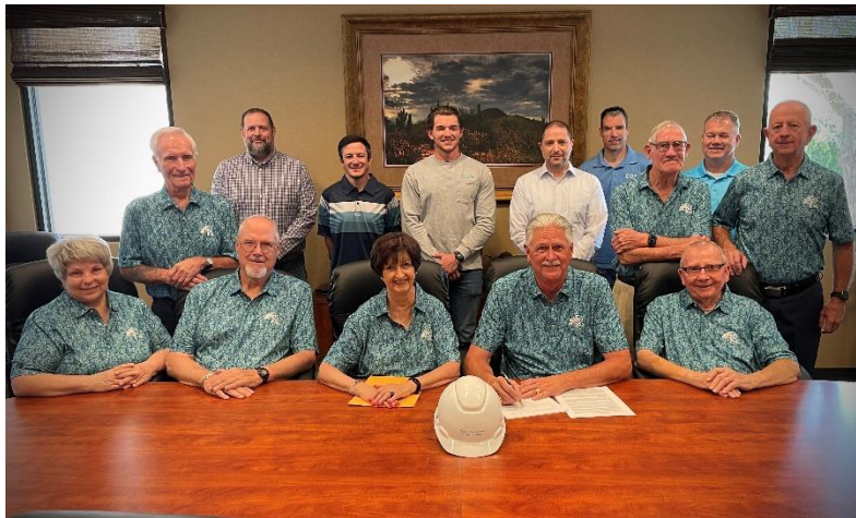
Cox team talks construction with Sun Lakes -Cottonwood & Palo Verde HOA team.