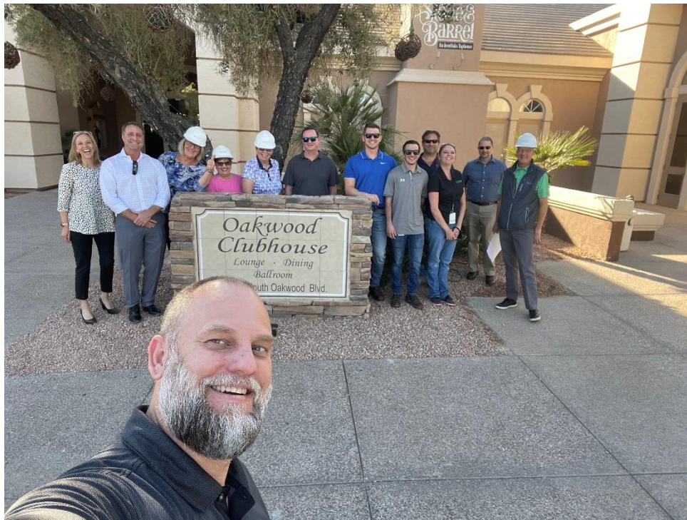
Cox team along with members of the Sun Lakes- IronOaks Homeowners Association.